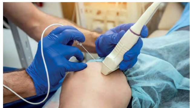
Figure 1. Radiofrequency ablation of the great saphenous vein using duplex ultrasound of the lower extremity veins.

tions for Treatment with superficial venous incompetence, management strategies mainly depended on clinical presentation (history, symptoms, signs) and detailed individual DUS findings, which were all mandatory for proper decision making, also reflux and occlusion in deep veins were excluded [7]. Treatment strategy was based on recommendation (ESVS 2022 Clinical Practice Guidelines on the Management of Chronic Venous Disease in Lower Limbs, recommendation №15, [1]) according which patients with superficial venous incompetence presenting with symptomatic varicos veins (VV) starting from CEAP C2s, superficial venous incompetence presenting with skin changes as a result of chronic venous disease (CEAP C4-C6), interventional treatment was recommended. Patients were also examined after one week post-operatively. Additionally,