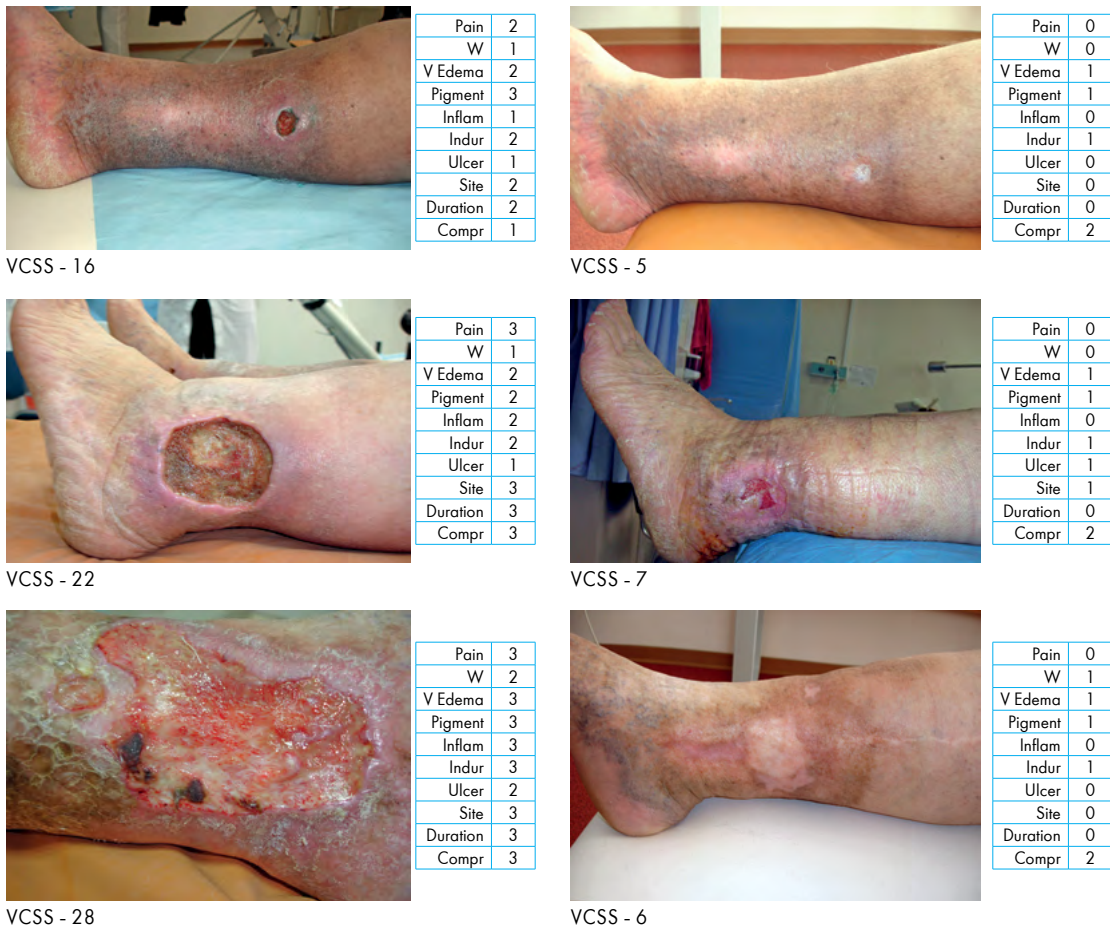
Figure 3. Evaluation of treatment effectiveness by VCSS classification; Our clinical cases, dynamics of complications on the lower limbs

nation of treatment effectiveness. We will provide below some of our examples.